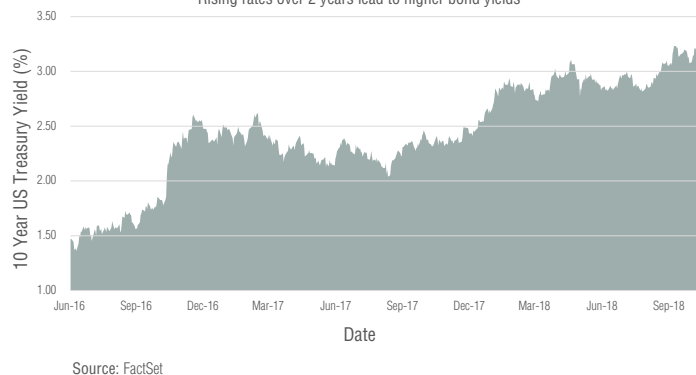
FIGURE 1 The Big Move In Interest Rates Has Occurred Rising rates over 2 years lead to higher bond yields

Well-anchored inflation appears to be reflected in the actions of central banks. The Fed has stopped its quantitative easing program and embarked on quantitative tightening – the raising of interest rates. Some analysts are concerned that other world banks tightening at the same time could cause a global quantitative tightening cycle, possibly weakening the economy. However, global inflation is low and the likelihood of world banks putting the brakes on monetary accommodation is also low.